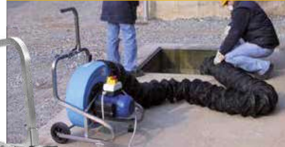
Ventilation positive and negative