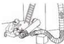
Suction of welding fumes in indoor works