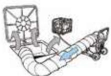
Ventilation of manholes and closed ambients