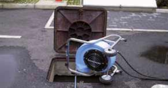
Ventilation positive and negative