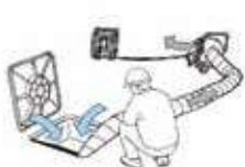
Aspiration in manholes and closed ambients