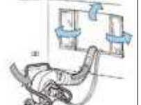
The fans can be positioned directly in the closed environment