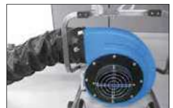
Detail of the quick installation system of the hoses on the tool mouth