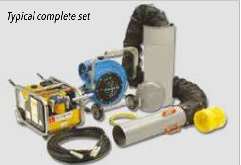
Typical complete set