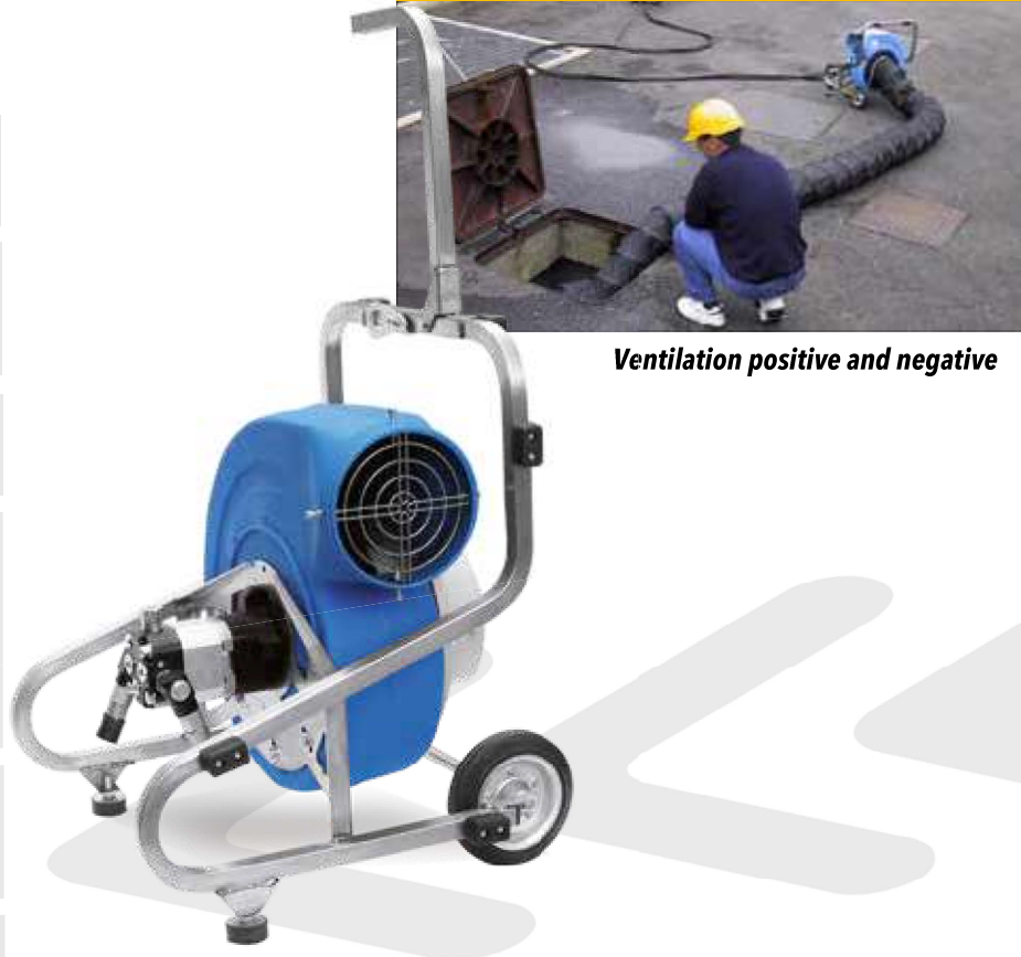
Ventilation positive and negative