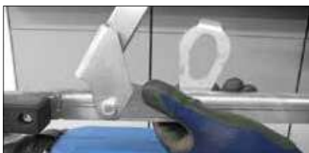
Folding handle with locking system