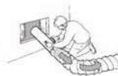
Aspiration and ventilation in a precise point