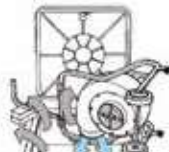
Direct ventilation without air hose